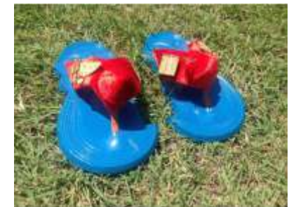
Traditional Slippers (Ahenema)