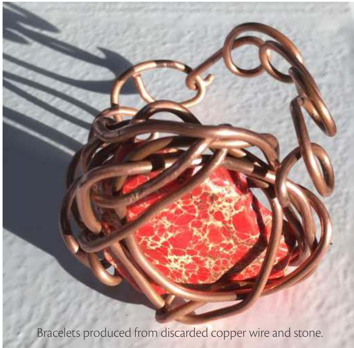
Bracelets produced from discarded copper wire and stone.