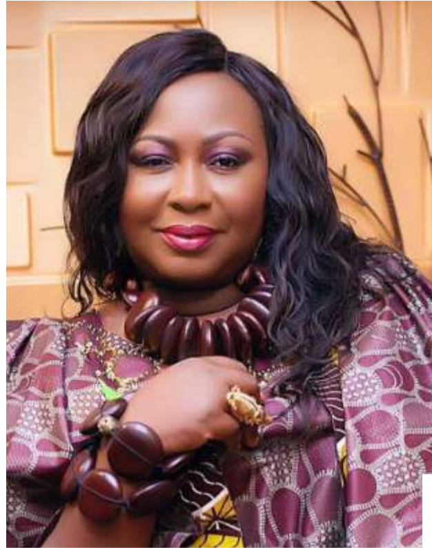
Flamboyant seeds used for jewelry