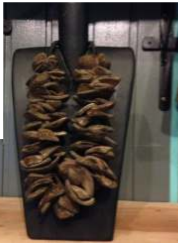
Handmade Necklaces from RECYCLED MATERIALS such as, Coconut shells. PROUDLY GHANAIAN.