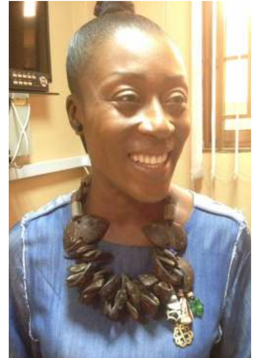
Coconut Shells used in making Necklace