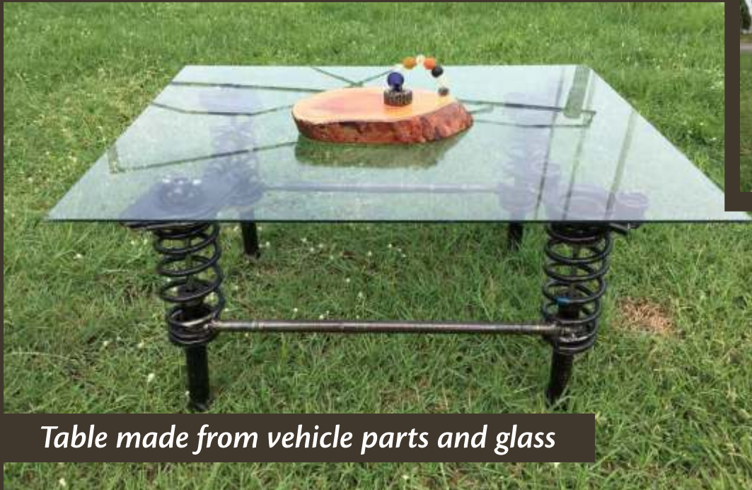
Table made from vehicle parts and glass

Together with their chain of workers including collectors, cleaners, producers and marketers they transitioned into innovating modern, alternative and minimalistic artistry in the form of Eco-friendly upcycle jewelry and decor. In making efforts to mitigate Climate in their own small way, they came up with the theme: 'TURNING TRASH INTO TREASURES' which drove them to pursue their underlying mission to exploit alternative uses of harmful waste, subsequently leading from recycle to upcycle!